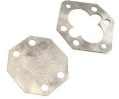
Portable Pumpehead Replacement Gasket

Since 2009, we have been supplying portable and stationary pumps for moving all types of oil. Oil cleaning centrifuges are also important tools to re-use oil as fuel or lubricant.