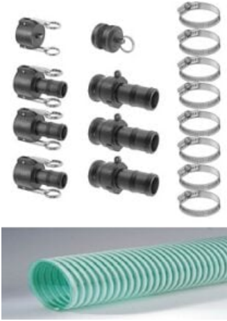
Oil Pump Hose Kit - 1.25 Inch

Since 2009, we have been supplying portable and stationary pumps for moving all types of oil. Oil cleaning centrifuges are also important tools to re-use oil as fuel or lubricant.