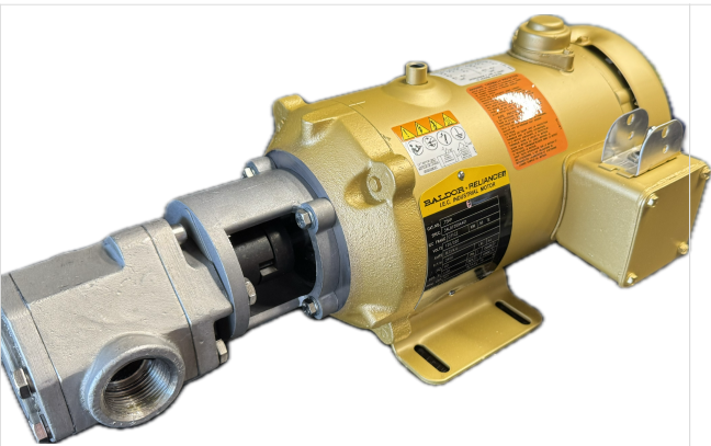
Stainless Steel 25GPM Oil Transfer Pump