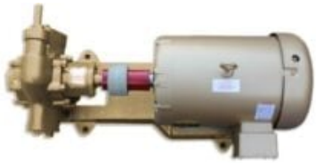
Industrial Oil Transfer Pump - 60GPM