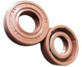
Portable Pump Shaft Seal

Since 2009, we have been supplying portable and stationary pumps for moving all types of oil. Oil cleaning centrifuges are also important tools to re-use oil as fuel or lubricant.