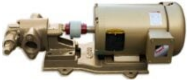
Industrial Oil Transfer Pump - 25GPM -3 Phase