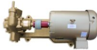
Industrial Oil Transfer Pump - 60GPM