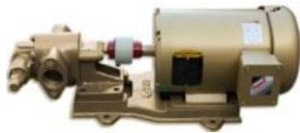
Industrial Oil Transfer Pump - 25GPM -3 Phase