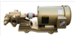
Industrial Oil Transfer Pump - 25GPM -3 Phase