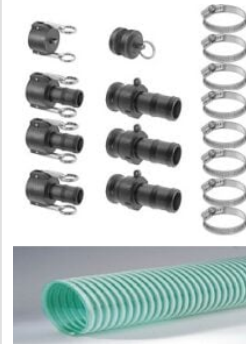
Oil Pump Hose Kit - 1.25 Inch