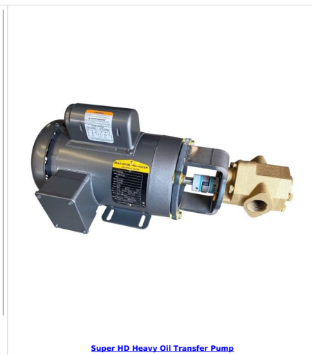
Super HD Heavy Oil Transfer Pump