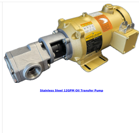
Stainless Steel 12GPM Oil Transfer Pump