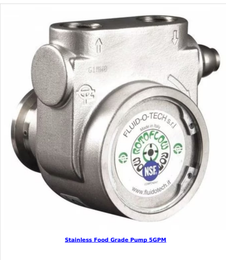
Stainless Food Grade Pump 5GPM