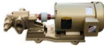
Industrial Oil Transfer Pump - 25GPM -3 Phase