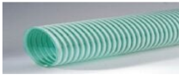
Oil Pump Hose Kit - 1.25 Inch