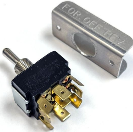
Portable Oil Transfer Pump Reversible Switch