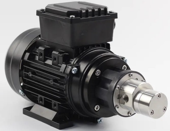
Food Grade Stainless Oil Circulating Pump 2GPM

Since 2009, we have been supplying portable and stationary pumps for moving all types of oil. Oil cleaning centrifuges are also important tools to re-use oil as fuel or lubricant.