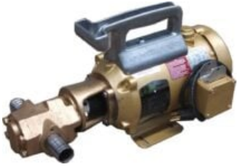
50Hz Portable Oil Transfer Pump - Massive Gears