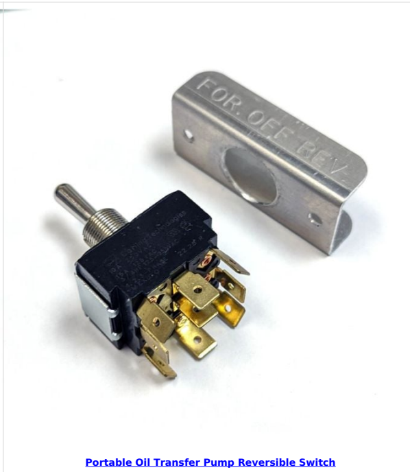
Portable Oil Transfer Pump Reversible Switch