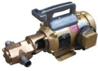
50Hz Portable Oil Transfer Pump - Massive Gears