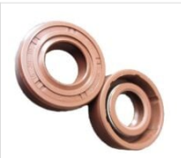
Portable Pump Shaft Seal