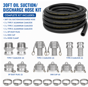
30ft Aluminum Camlock Hose Kit