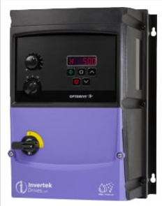
7.5HP VFD for 60GPM Pump Outdoor