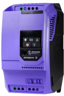
7.5HP VFD for 60GPM Pump Indoor