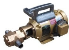
50Hz Portable Oil Transfer Pump - Massive Gears

Since 2009, we have been supplying portable and stationary pumps for moving all types of oil. Oil cleaning centrifuges are also important tools to re-use oil as fuel or lubricant.