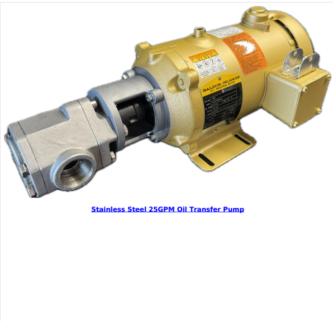
Stainless Steel 25GPM Oil Transfer Pump