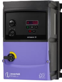
7.5HP VFD for 60GPM Pump Outdoor

Since 2009, we have been supplying portable and stationary pumps for moving all types of oil. Oil cleaning centrifuges are also important tools to re-use oil as fuel or lubricant.