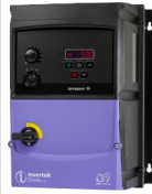
7.5HP VFD for 60GPM Pump Outdoor