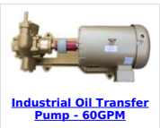
Industrial Oil Transfer Pump - 60GPM