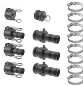
Oil Pump Hose Kit - 1.25 Inch